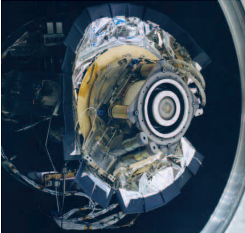
SMART-1's novel ion-engine propulsion system

the TRP and GSTP programmatic objectives, and with the Agency's plans for future missions and programmes. Programme Guidelines described the principles of the ESA Technology Master Plan, the details of the specific TRP/GSTP preparation process (including the financial bases), and the criteria used in evaluating activity proposals. Specific guidelines were also issued reflecting the vision, targeting model, and focus of the efforts for each Theme.